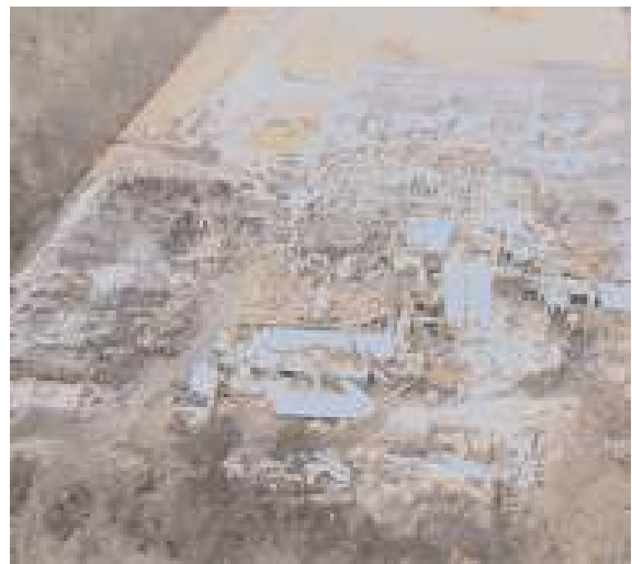
A pharmaceutical plant after a dust explosion.

An initial (primary) explosion in processing equipment or in an area where fugitive dust has accumulated may dislodge more accumulated dust into the air, or damage a containment system (such as a duct, vessel, or collector). As a result, if ignited, the additional dust dispersed into the air may cause one or more secondary explosions. These can be far more destructive than a primary explosion due to the increased quantity and concentration of dispersed combustible dust. Many deaths in past accidents, as well as other damage, have been caused by secondary explosions.