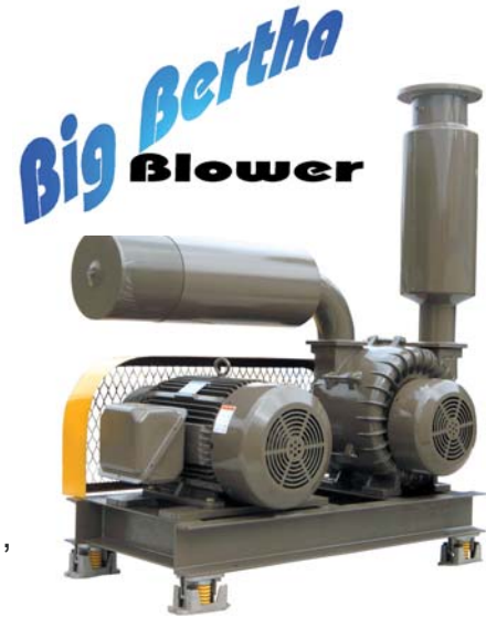
V-Belt Connected Package