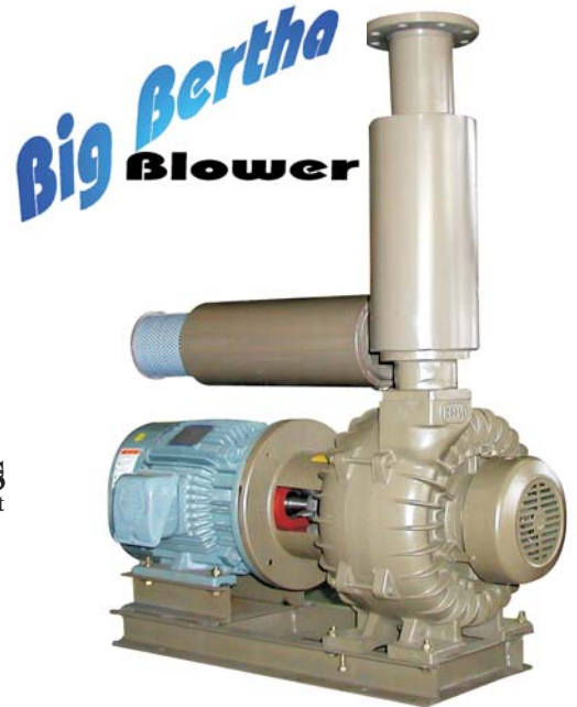
Direct Connected Package